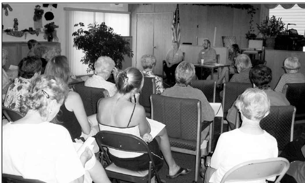
The Sedona audience is most attentive.