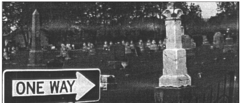
Just as we always feared ...

for willingness to serve on the Tucson Board